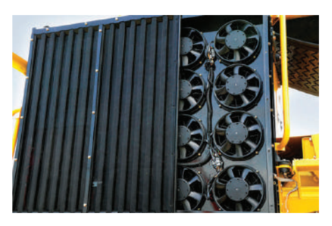
COOLING SYSTEM. To reduce sound levels and maximize power to material processing functions, the cooling system includes electrically powered, variable speed reversible fans.