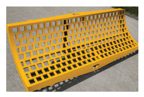
DUAL SCREENS. Hinged, dual screens boost processing efficiency and offer flexibility in end-product sizing.