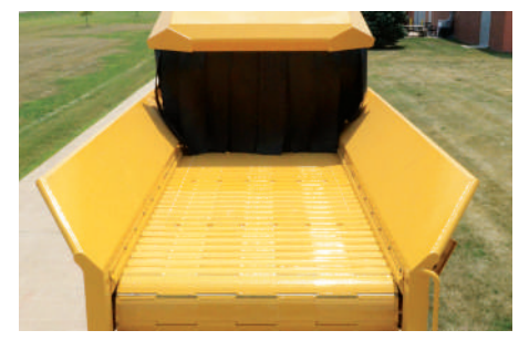
WIDE INFEED TABLE. A 152,4 cm (60") wide infeed table with flared sidewalls can accommodate a large volume of material.